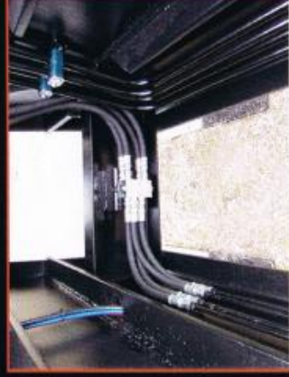
Neat, Professional Mounting of Tubes, Hoses, and Valves

Manufactured by Big John Trailers for Kodiak, LTD