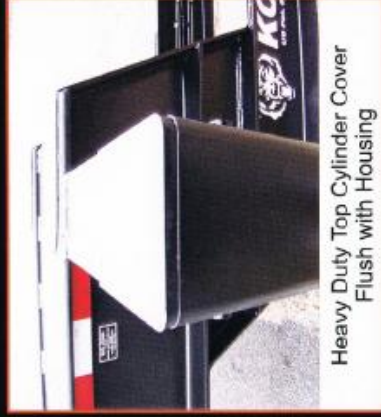
Heavy Duty Top Cylinder Cover Flush with Housing