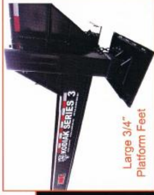
Large 3/4" Platform Feet